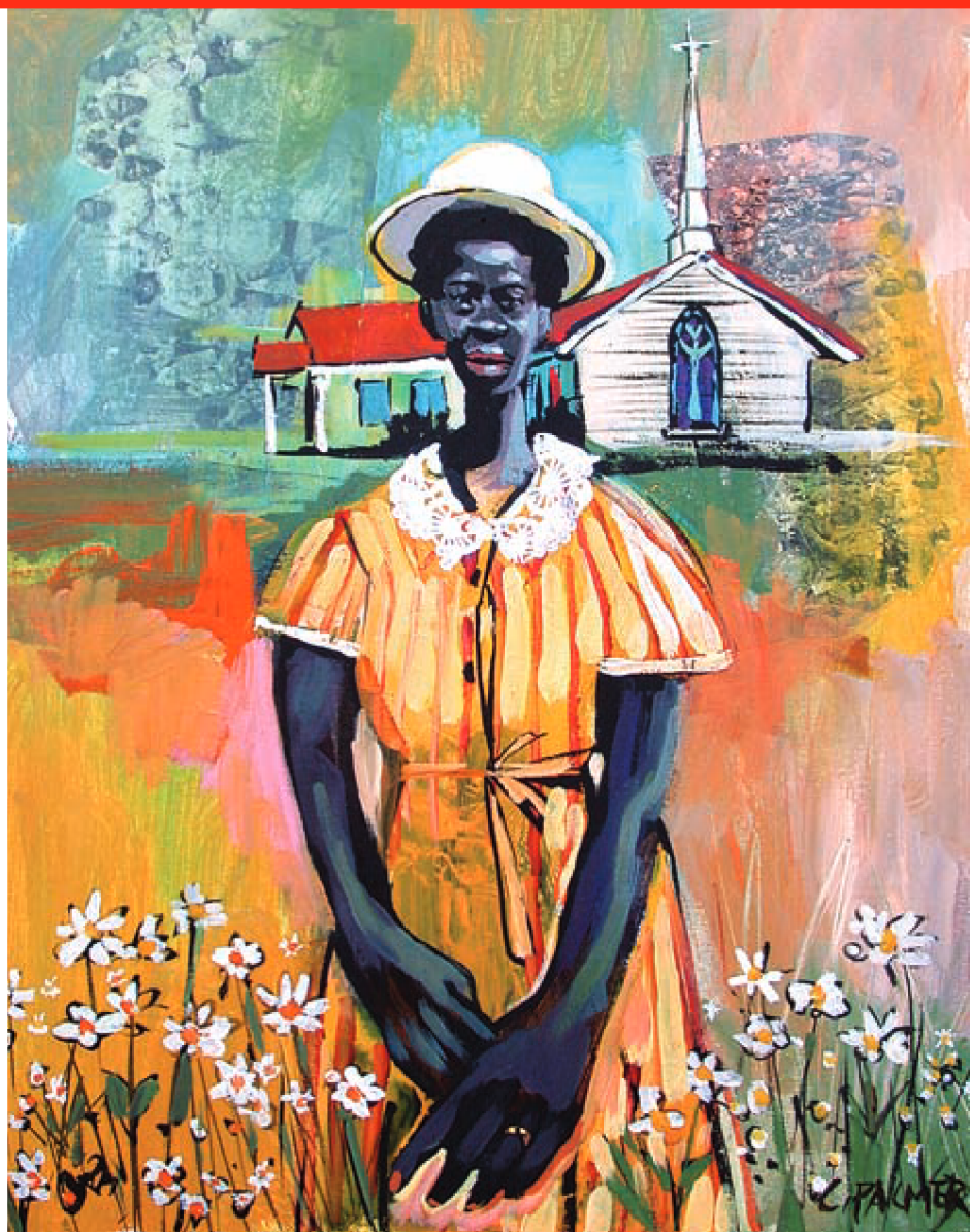
Field of Hope , Charly Palmer. Mixed media collage on canvas, 24" × 18". © Charly Palmer.