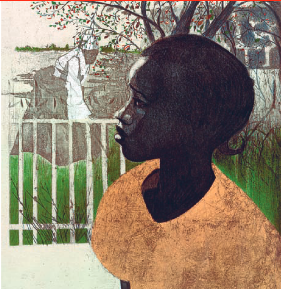
New Dreams (2002), Ernest Crichlow. Lithograph (Edition 150), 24 \frac{3}{4} " \times 16 \frac{3}{4} ".